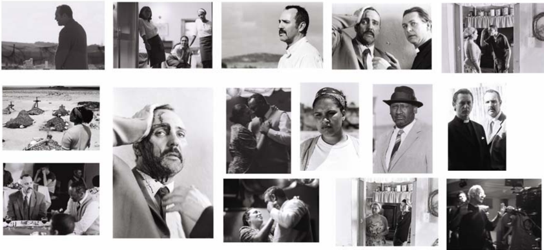
Photo Gallery Black and White Photos